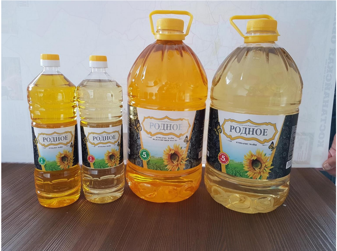
Photo of the product