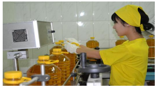
Photo #5 of the product