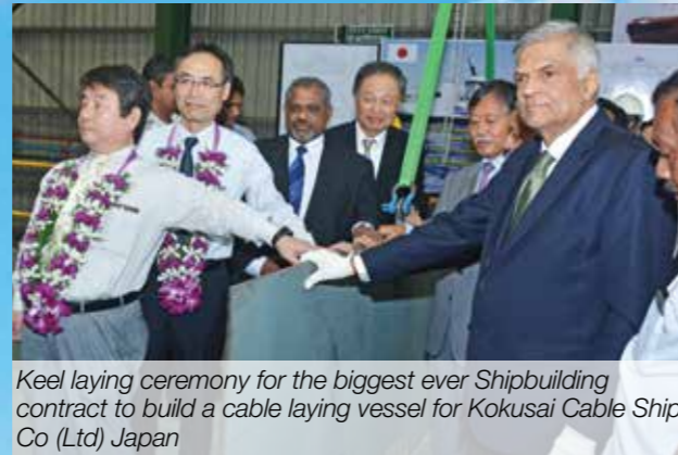
Keel laying ceremony for the biggest ever Shipbuilding contract to build a cable laying vessel for Kokusai Cable Ship Co (Ltd) Japan

KDDI Cable Infinity is an ultra modern Cable Laying Vessel built by Colombo Dockyard for Kokusai Cable Ship Co. Ltd. (KCS) of Japan. This is the biggest ever vessel built by Colombo Dockyard in its illustrious journey of shipbuilding excellence and the first ever ship built 'in its class' from Sri Lanka to Japan.