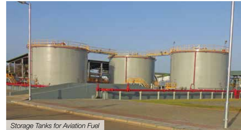
Storage Tanks for Aviation Fuel

With an extensive technical know-how & experience gained from a proud & distinguished history of four decades, DGES is dedicated to perfection and committed to deliver quality products and services on time, in the fields of civil, mechanical and electrical engineering from design and construction, including value added services and value engineered services especially for petrochemical, mini hydro power, mega power, building, irrigation, heavy structures, infrastructure development, and marine construction sectors.