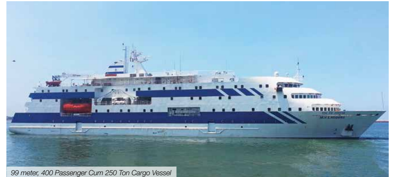
99 meter, 400 Passenger Cum 250 Ton Cargo Vessel

All these Vessels were designed for the carriage of Passengers and general cargo, between the Mainland and Lakshadweep Islands and operate in the inter-island routes. These Vessels have greatly eased the congestion and provides an uninterrupted service for passengers and freight from Cochin to Lakshadweep islands, a journey which usually takes around 20 hours.