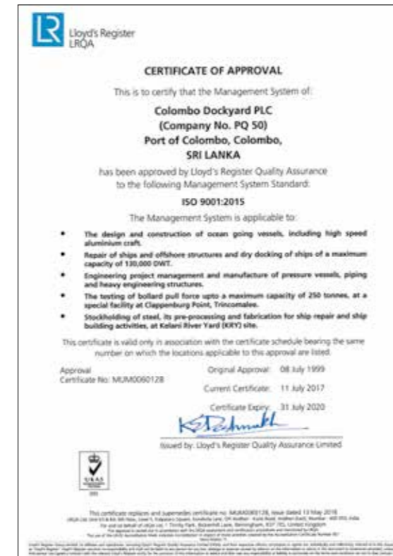
ISO 9001:2015 QMS Certificate