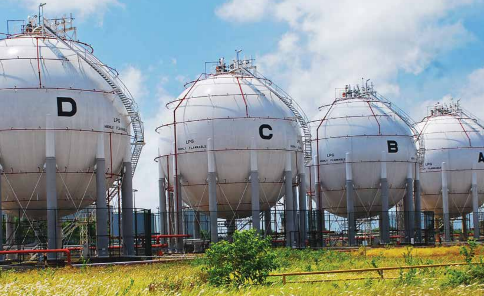
LPG Storage Tanks for Shell Terminal Lanka