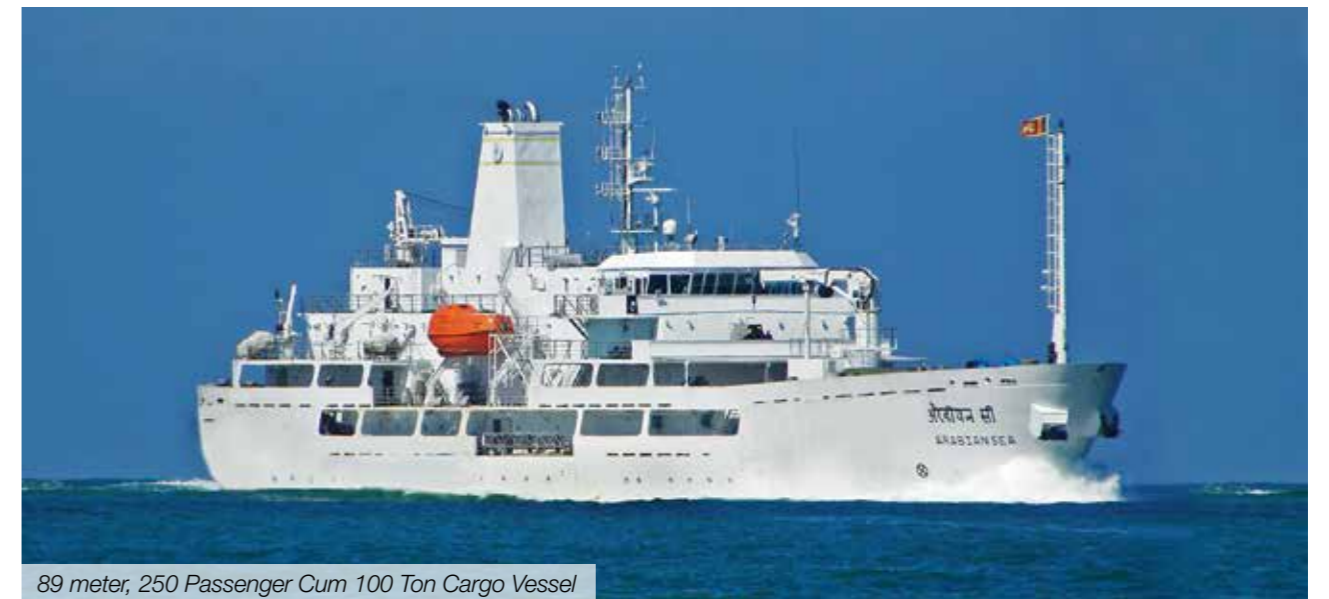
89 meter, 250 Passenger Cum 100 Ton Cargo Vessel