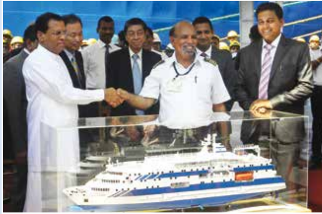
The President Maithripala Sirisena attended the delivery ceremony of the passenger vessel and expressed the Sri Lankan government's fullest support to the ship building/repair industry.

With over 4 decades of experience to our credit Colombo Dockyard has evolved into a formidable force in the regional shipbuilding arena. Our capabilities are defined by the type of vessels we manufacture.