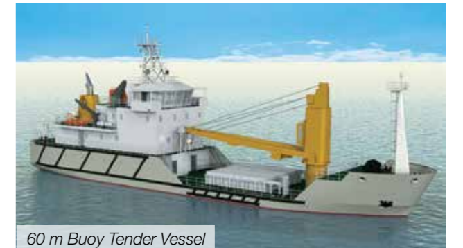
60 m Buoy Tender Vessel

Both built to be operated in the middle east, special consideration has been made to select machinery and equipment capable of withstanding the harsh terrain encountered in the operational area.