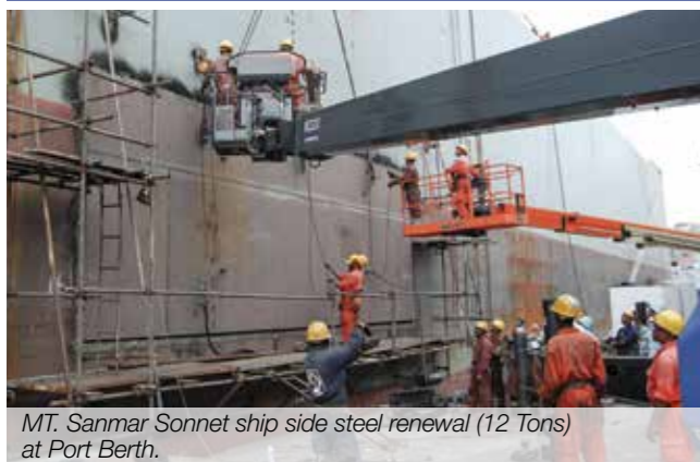
MT. Sanmar Sonnet ship side steel renewal (12 Tons) at Port Berth.

Quick Response by a Dedicated Afloat Repair Team 24 x 7 x 365 Hotline : +94 76 820 6011 E-Mail : afloatrepair@cdl.lk