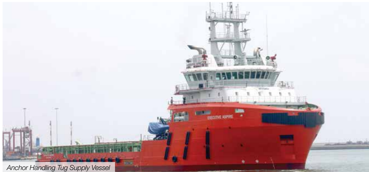
Anchor Handling Tug Supply Vessel