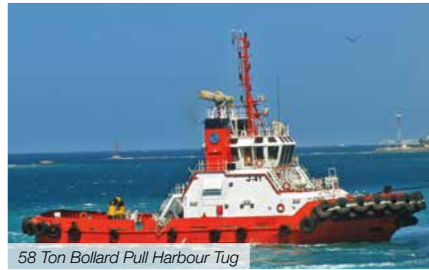
58 Ton Bollard Pull Harbour Tug

Incidentally, all Tug Boat requirement of the Sri Lanka Ports Authority have been met by us. In addition, three numbers 58 Ton Bollard Pull Tug Boats for the Jeddah Ports Authority of the Kingdom of Saudi Arabia were constructed and delivered by us during the recent past.