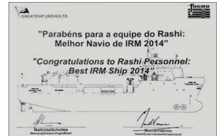
Accolades Won by our Ships