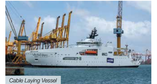
Cable Laying Vessel

The vessel design has flexible operational capabilities and provides a comfortable platform for the operational personnel. This vessel was built under ClassNK meeting the regulatory requirements of the Japanese Government. The design is from VARD Designs in Norway.