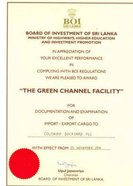
The green Channel Facility Certification