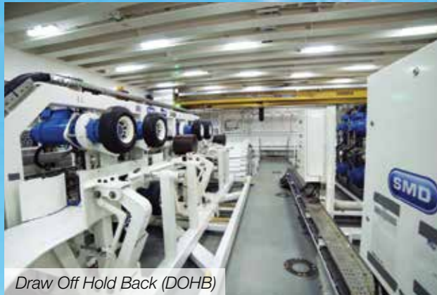
Draw Off Hold Back (DOHB)