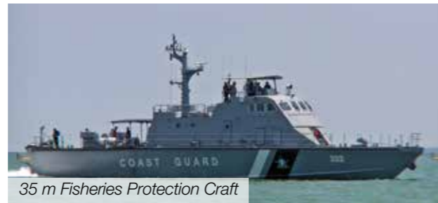
35 m Fisheries Protection Craft