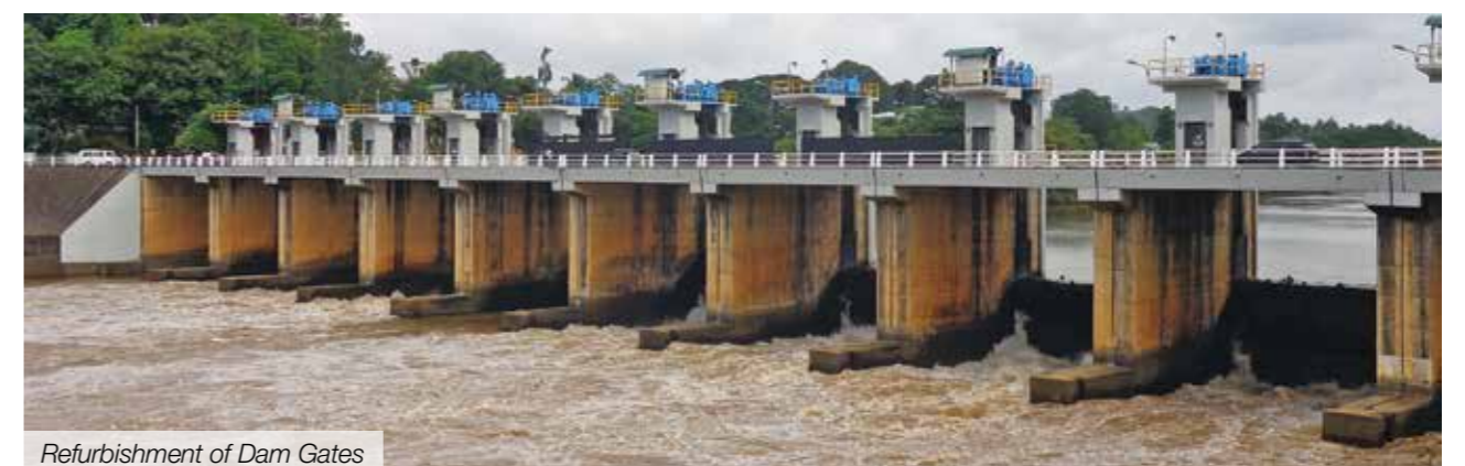
Refurbishment of Dam Gates