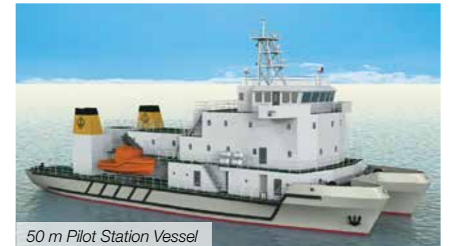
50 m Pilot Station Vessel