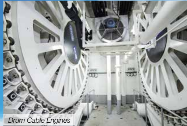
Drum Cable Engines