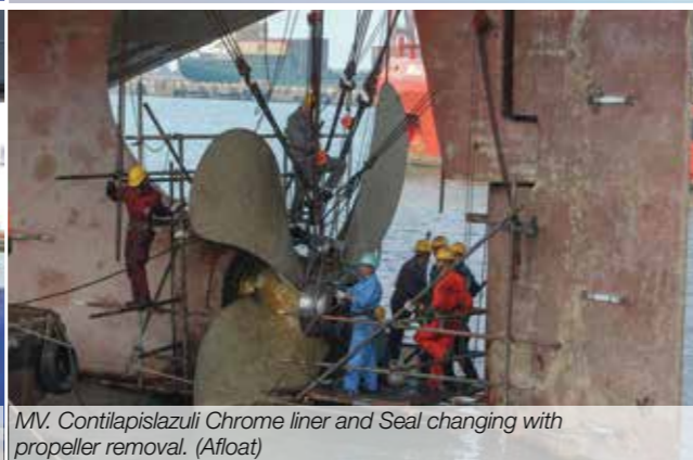
MV. Contilapislazuli Chrome liner and Seal changing with propeller removal. (Afloat)