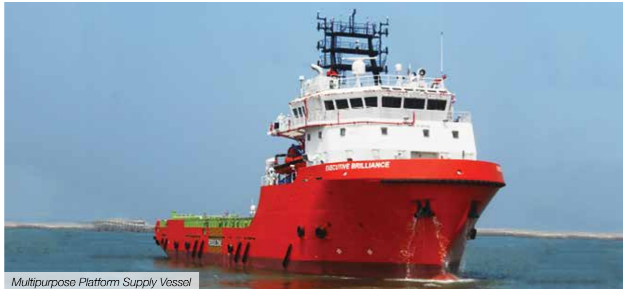
Multipurpose Platform Supply Vessel

Over the recent past, we have delivered more than 24 Offshore Support Vessels to Singaporean and Indian Ship owners and all vessels built by Colombo Dockyard, has been able to secure charters immediately the vessel is delivered to the owners. These Vessels have been chartered to oil majors such as PETROBRAS of Brazil, PETRONAS of Malaysia, SHELL of Netherlands, INPEX of Japan to name a few. In some instances, Colombo Dockyard built vessels have been the Charterer's preferred choice due to the Vessels reliability and high levels of crew comfort provided in these class of vessels.