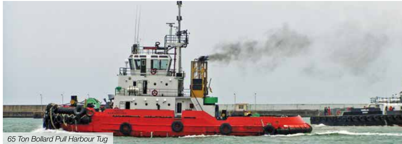
65 Ton Bollard Pull Harbour Tug