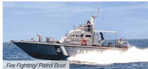
Fire Fighting/ Patrol Boat

On a similar note, we have also contributed to develop the Maldivian Coast Guard fleet. We constructed and delivered a large number of Vessels for the Maldivian Coast Guard ranging from 24 m Coastal Surveillance Vessels to 42 m Offshore Patrol/ Fisheries Protection Vessels.