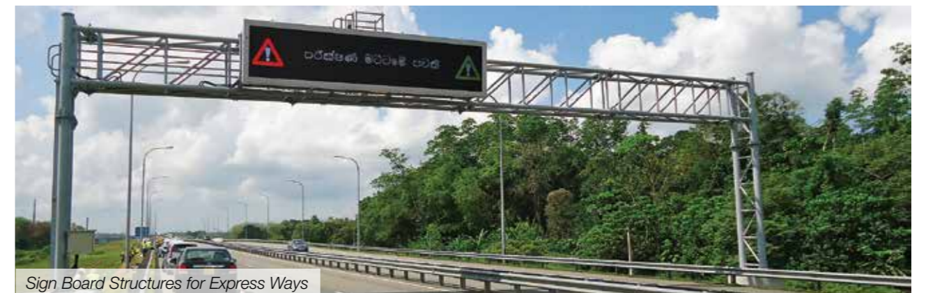
Sign Board Structures for Express Ways